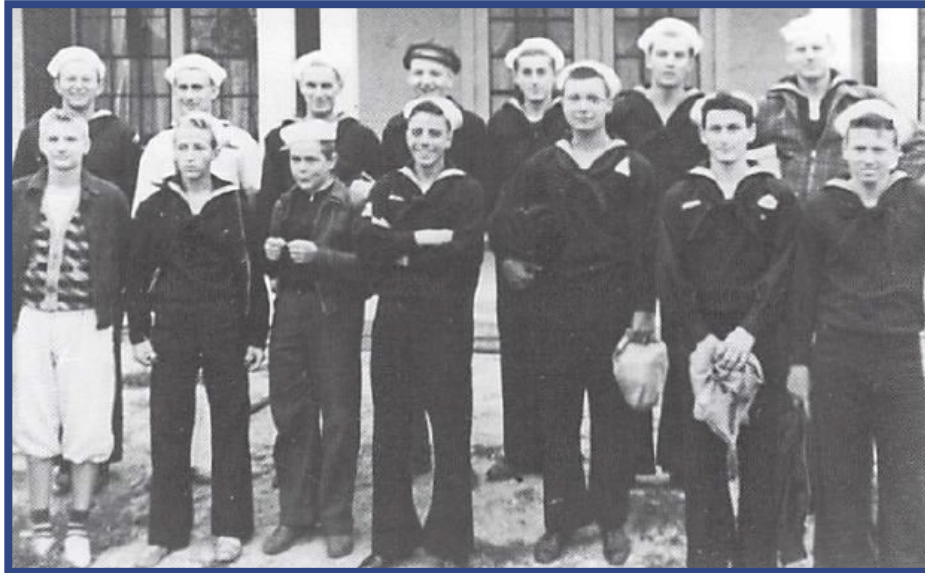
The members of Sea Scout Ship #50 gather for a portrait in front of the Clubhouse sometime around 1939. The Ship has been chartered under club sponsorship in 1936.